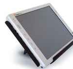
Survey tablet in docking station